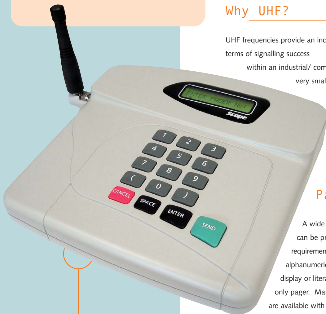
DataPage Lite transmitter

*Note that DataPage Lite can only send numeric characters.